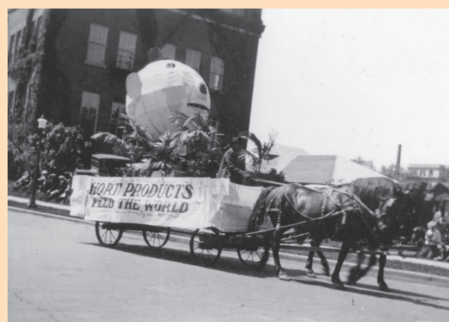
Parade Float 1922