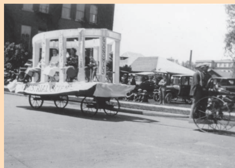
Parade Float 1922