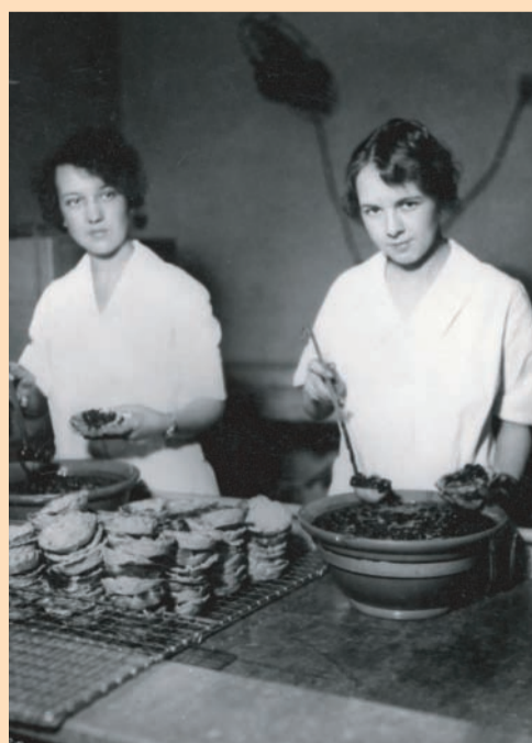
Cherry Pies 1929