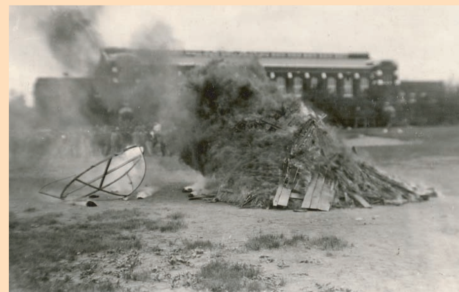
Moving Up Ceremony Buring of the Beanies 1926