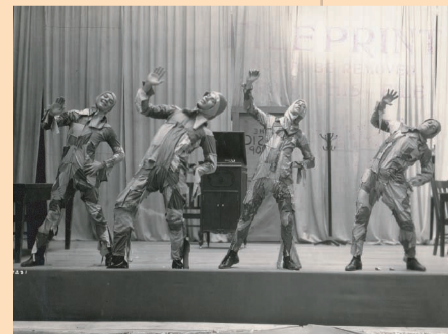
Nite Show 1923