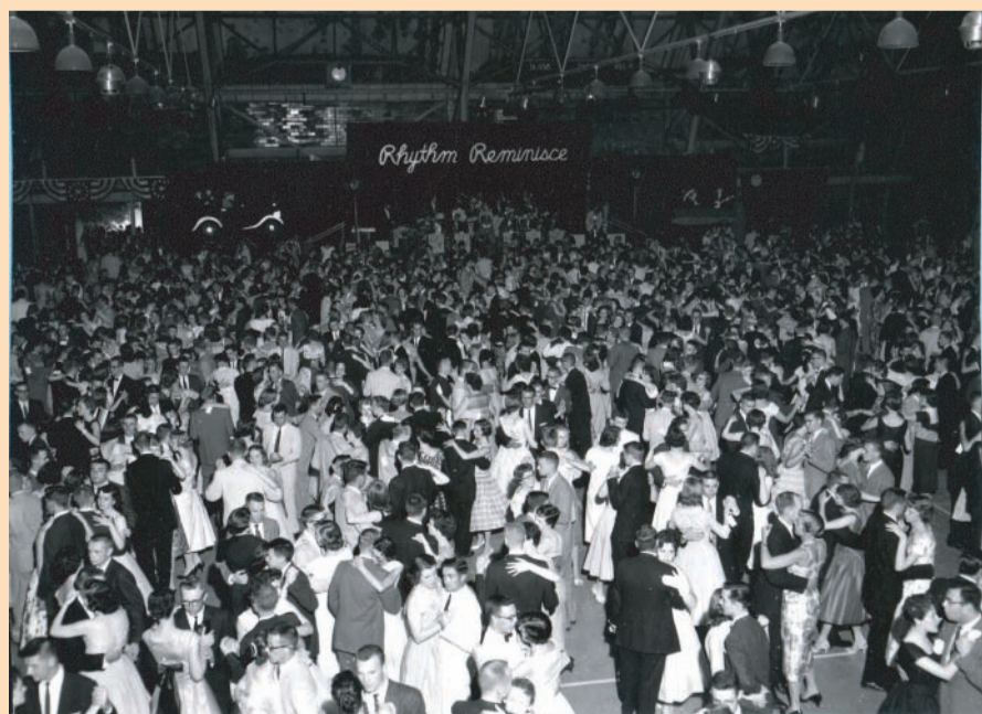
VEISHEA Dance 1958