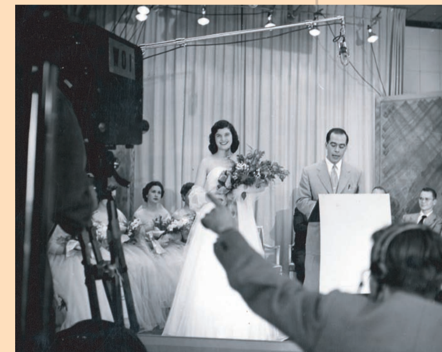
Queen of Queens 1951