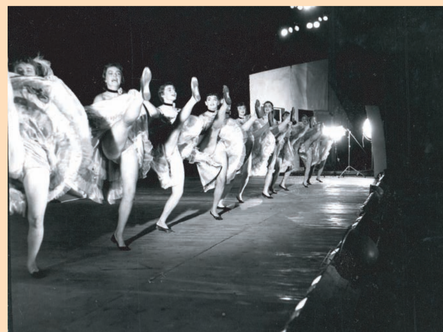
Stars Over VEISHEA 1958