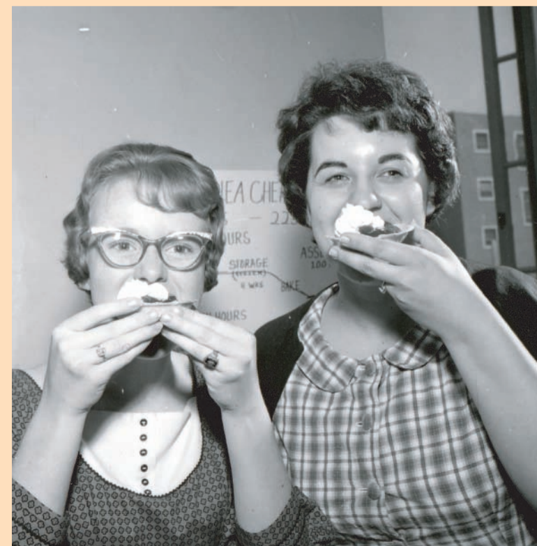
Cherry Pies 1962