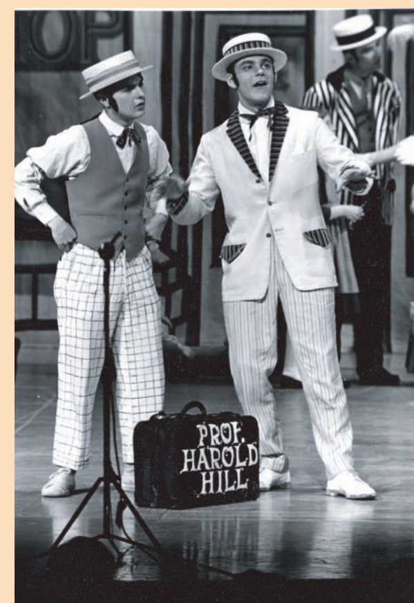
Stars Over VEISHEA 1963